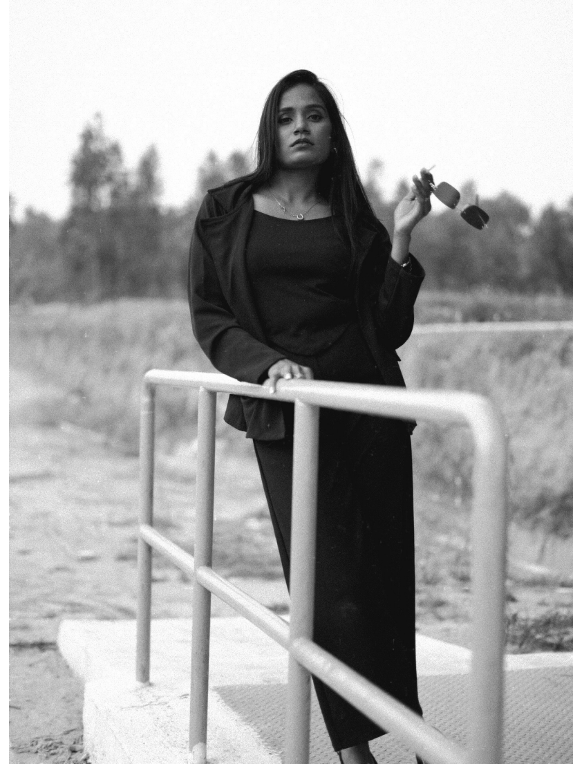
Plum & Poise The Concept Portrait Series

Xtreme Modelling Company Brand Ambassador