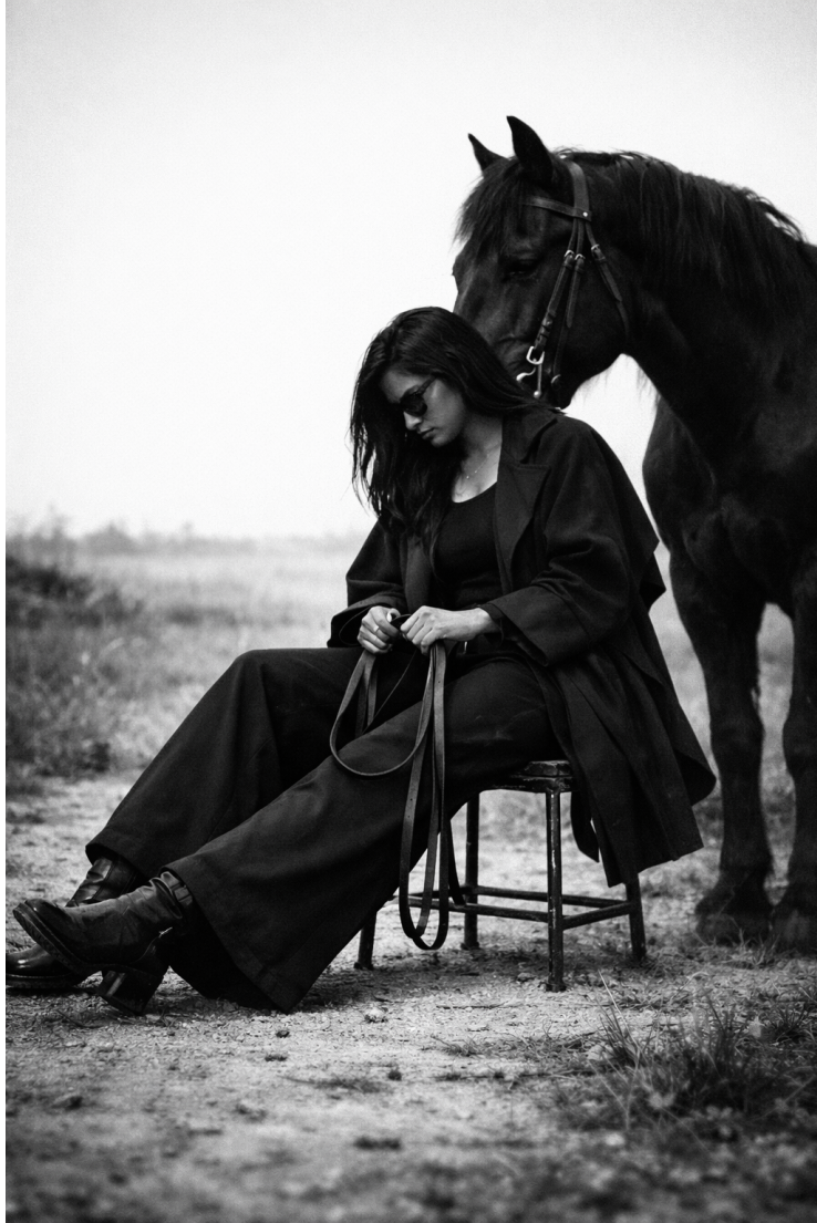
Outdoor Elegance A Fusion of Style, Nature, and Confidence

Showstopper Moment – Xtreme Modelling Company